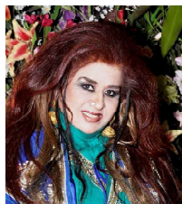
By: Shahnaz Husain

Don't abandon your beloved smokey eye on summer evenings in an open area or closed air conditioner room. Smokey eyes are always trendy, and they work for parties. If you want something flirty. Apply